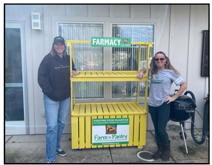
Thank you Farm to Pantry!